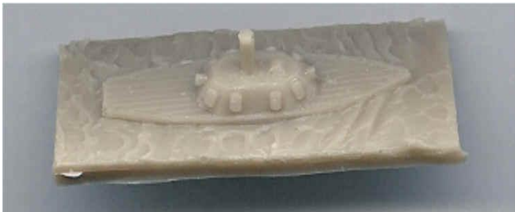
Figure 2 CSS Neuse

Naturally such a small range includes USS Monitor and CSS Virginia, and also other vessels that I already had from Navwar's excellent (and extensive) white metal range. I also had some emplaced batteries from Irregular's very useful 2mm range. However Parkfield's offerings are very attractive and I did find a couple to purchase - CWN7 CSS Neuse and some CWN8 3-Gun Shore batteries. Parkfield's offerings are in resin (with metal smoke stacks), and the ships come on rectangular scenic sea (or river!) bases, which is a very nice touch.